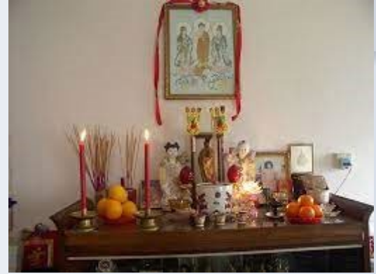
Buddha, Vishnu, Mary, Ancestor Worship